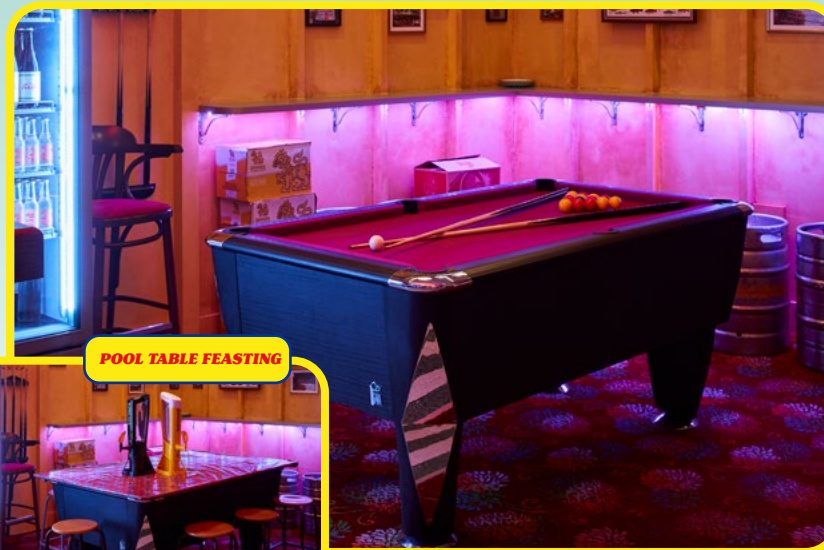
POOL TABLE FEASTING